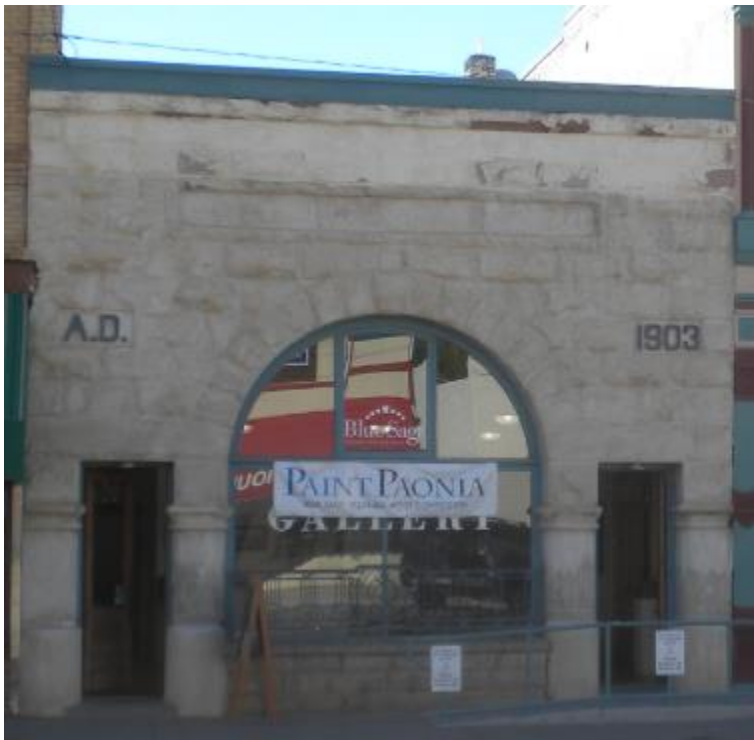
The Building Today

would revert back to the Town of Paonia unless the Town approved the change. The plan is to restore the building to the way it looked in 1903.