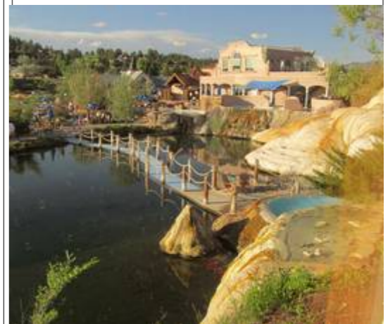
The Pagosa Springs